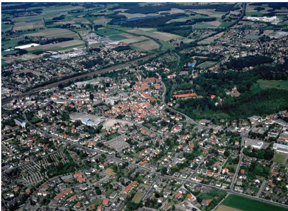
City of Rheda

The historic town centres and Rheda castle are proof of the importance of our town through history and remain so to this day. Retail business flourishes in this special atmosphere, and together with a lively cultural scene makes the town both liveable and enjoyable. Quality of life is high here. The business development service strives to maintain this quality for the future and, together with many partners, is actively involved in working on further improvements.